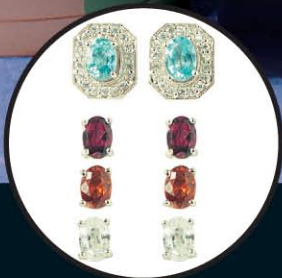
Earring jacket with interchangeable semiprecious stone studs ($550 for the set) from Boccelli.