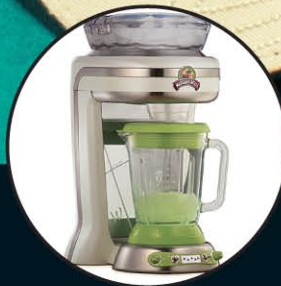
Jimmy Buffett's Margaritaville Key West Frozen Concoction Maker ($330) from Margaritaville's Smuggler's Hold.