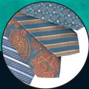
Assorted 100 percent silk ties ($125 each) from Jaz.