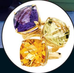
Colored gemstone rings , in amethyst, citrine and yellow quartz ($1,350 each) from Tiffany & Co.