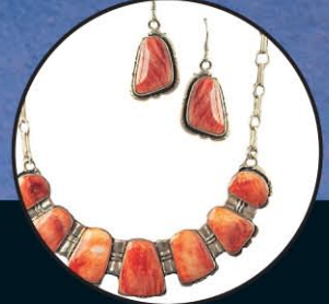
Spiny Oyster stone and sterling silver handmade Native American earrings/necklace set ($400) from Trading Cove.