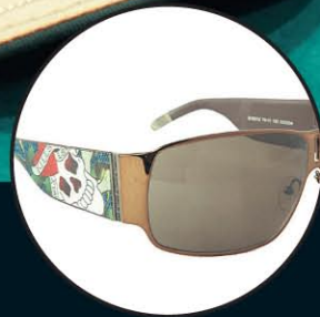
Ed Hardy "Love Kills Slowly" sunglasses ($255) from Sunglasses U.S.A.