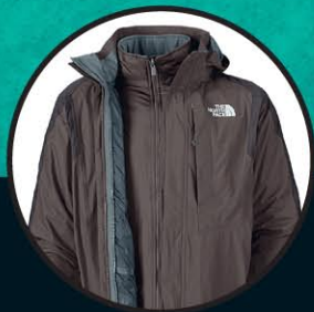
The North Face men's Amplitude Triclimate jacket ($230) from Trailblazer.