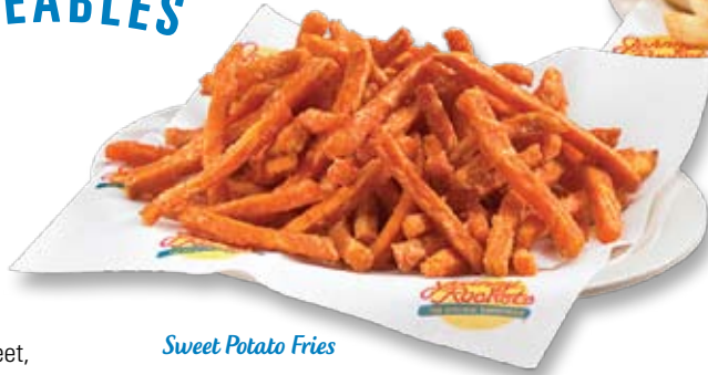
Sweet Potato Fries

CHILI BOWL Our exclusive home style, all-meat recipe. $4.25