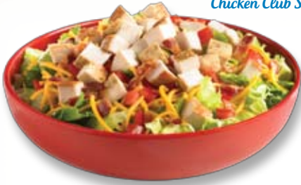
Chicken Club Salad