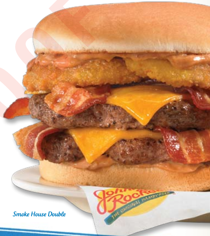
Smoke House Double