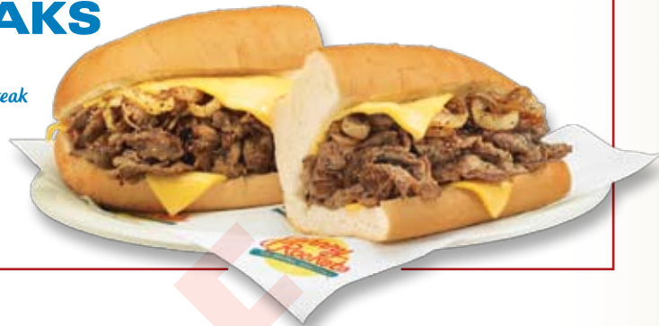
Philly Cheese Steak

ADD: Grilled Bell Peppers or Grilled Mushrooms for $1.75