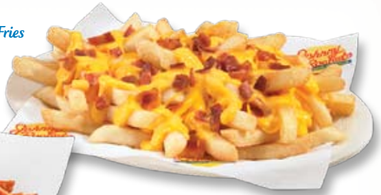
Bacon Cheese Fries