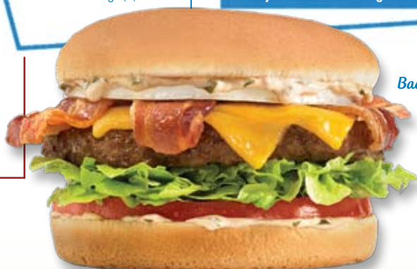
Bacon Cheddar Single

Substitute 100% Soy Boca® Burger, Turkey Patty, Grilled Onions, Wheat Bun or any cheese at no charge.